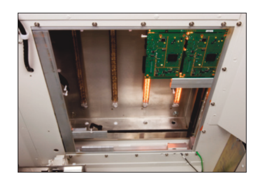
TOP SIDE INSTANT IR PRE-HEAT